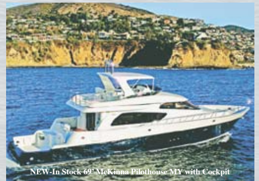
NEW-In Stock 69' McKinna Pilothouse MY with Cockpit