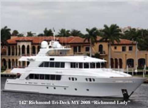
142' Richmond Tri-Deck MY 2008 "Richmond Lady"

1.888.215.2685 INFO@DTFYACHTS.COM 954.767.0007