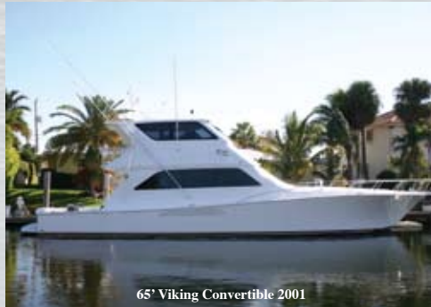
65' Viking Convertible 2001