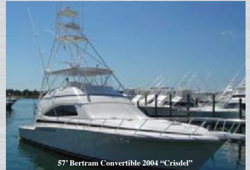
57' Bertram Convertible 2004 "Crisdel"