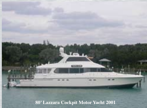
80' Lazzara Cockpit Motor Yacht 2001